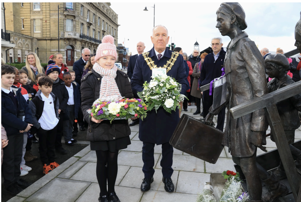
Pictured: Holocaust Memorial Day ceremony, 27 January 2023.