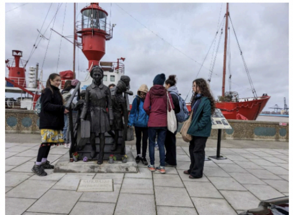
Pictured: 'Kehilot' (Jewish communities) youth group guided visit