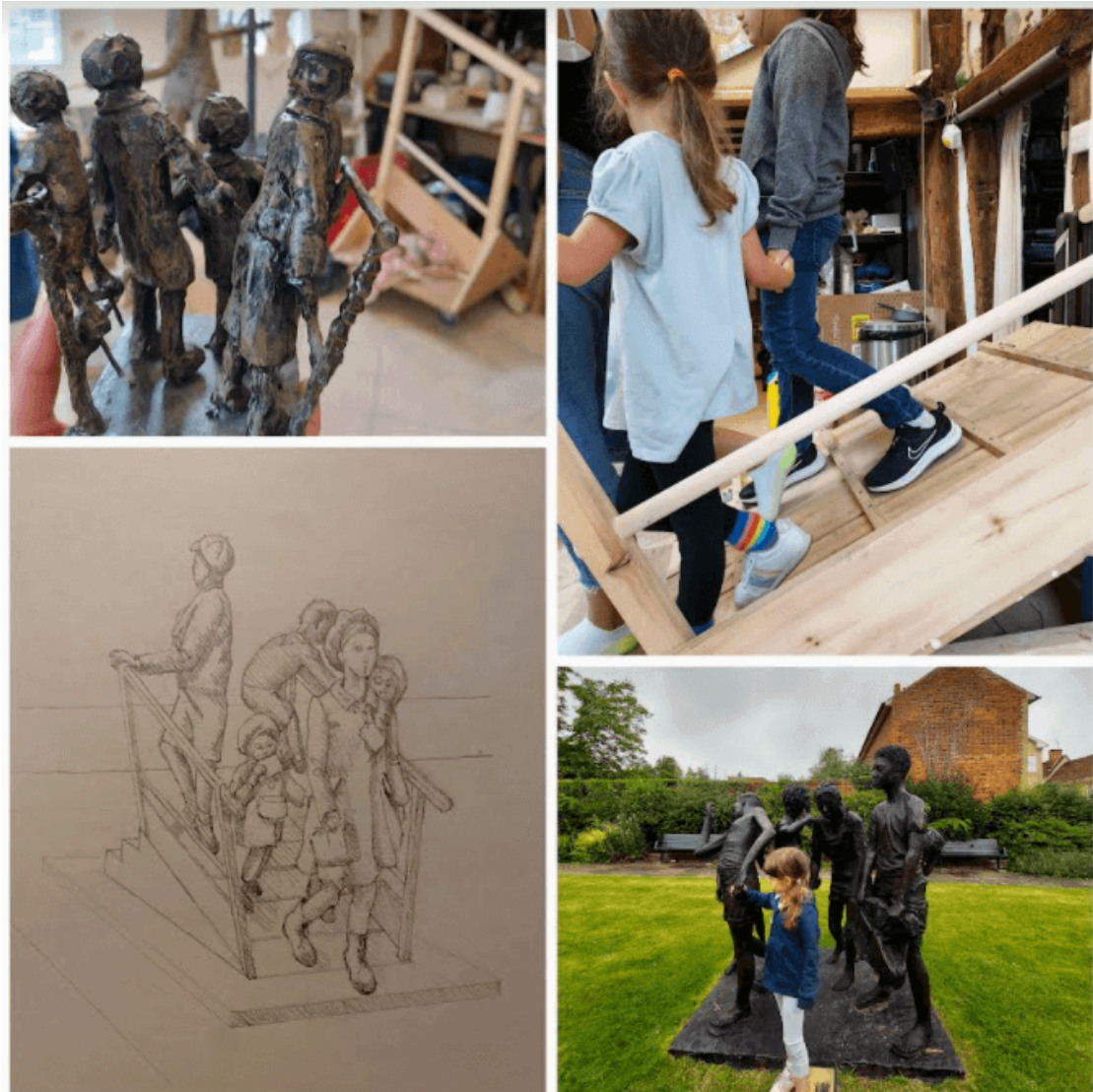
Pictured: Collage from the statue creation process